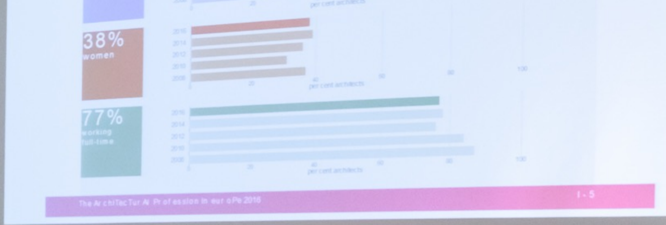
Facts and Figures – Sarah Rivière, n-ails e.V.